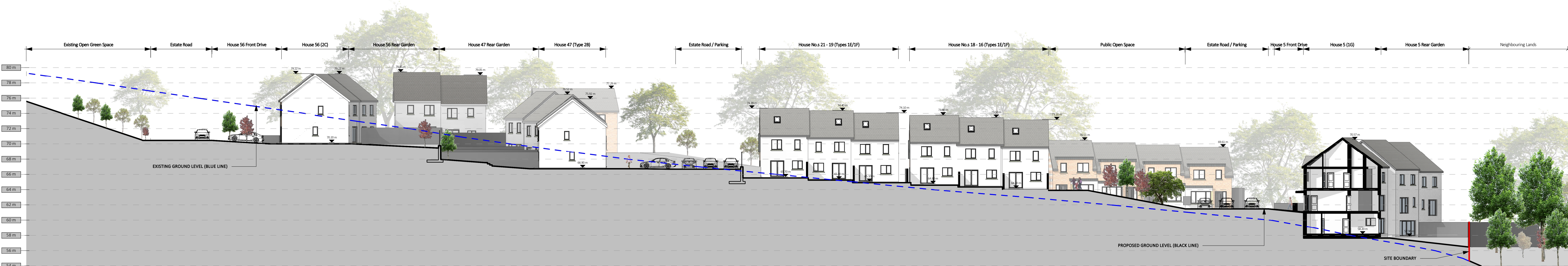
2 Section M 1 : 250